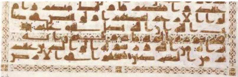
Image from chapter 9 of the Gold Qur'an showing inserted chapter name to mark separation

In reviewing the older written texts, it was found that the older texts indeed do not carry a Basmallah for chapter 9, and that the ability to realize the separation between chapters 8 and 9 is achieved through a man-made injection of the chapter name to highlight the beginning of a new chapter.