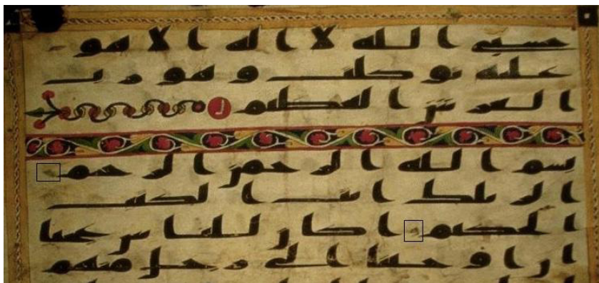
Image from chapter10 of the Sanaa Qur'an dated around 800 AD. 1 which shows no chapter name/heading

In reviewing the oldest written records of the Scripture, it was found that no actual chapter names as used in current printed editions ever existed (e.g. ‘the cow, the family of Imran, the women, etc.’) and that they were later insertions to ease reference.